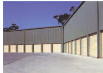
Industrial Rol•a•Door® perfect for multiple storage facilities.