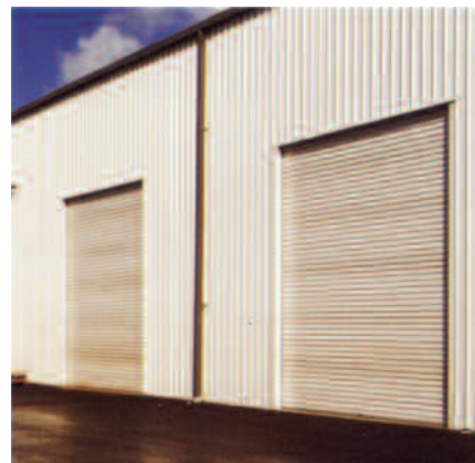
Gliderol Guarantee All new Gliderol Roller Doors come with the Gliderol guarantee. Complete warranty details will be clearly outlined at point of sale.