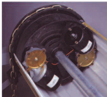
Detail B: Interior view of Dual 1/3 HP DC motors inside the coil of the door. Also shown is the chain hoist sheave, which accepts welded chain and the chain guide.

The Company reserves the right to make changes or improvements to the products or accessories without notice and without incurring any obligation to make similar changes or improvements to goods previously ordered.